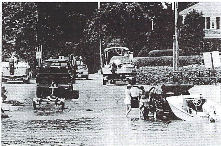
Cars and trailers line up Sunday morning to put boats back in the harbor.